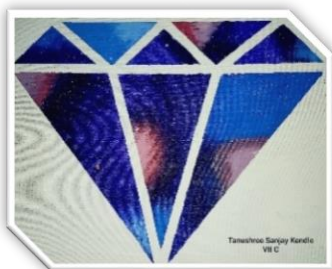
Artist: Tanushree Kendle | VII-C