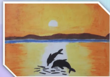
Artist: Siddhi Nemade | VII-B